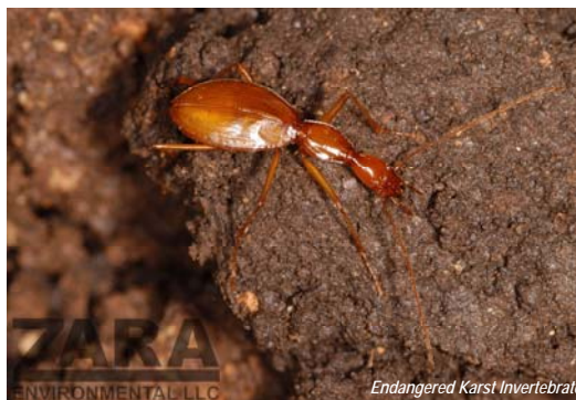
Endangered Karst Invertebrate