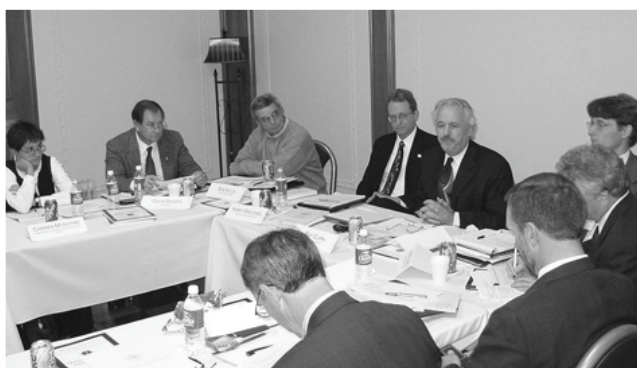
Southern Regional NEPA Roundtable discussion on the NEPA Task Force report Modernizing NEPA Implementation