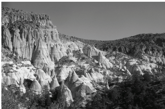
Tent Rocks, Jemez Mountains.