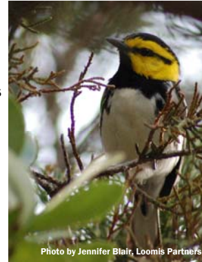
Endangered Golden-cheeked Warbler

Recognizing the need to allow communities and economies to flourish, the Endangered Species Act includes provisions that allow harm to endangered species in return for conservation actions that benefit those species elsewhere. The U.S. Fish and Wildlife Service administers a permitting program that authorizes impacts to endangered species by those that implement an approved Habitat Conservation Plan . The Habitat Conservation Plan specifies conservation measures that compensate for the harm to threatened or endangered species