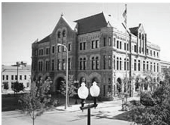
US District Courthouse, Sioux Falls, SD

From top left: Courthouse, Sioux Falls, South Dakota