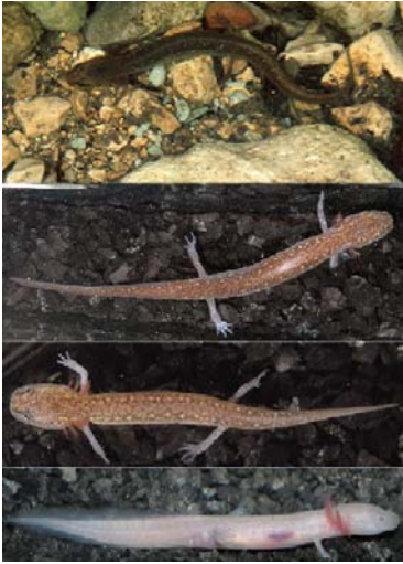
Eurycea salamanders of central Texas caves and springs

Prepared for Loomis Partners, Inc. 3101 Bee Cave Road, Suite 100 Austin, TX 78746