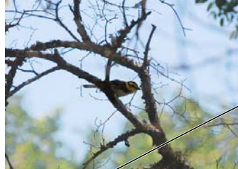
Photo 2. Female GCW.