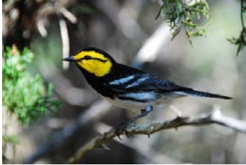
Photo 1. Male GCW in Bexar County (May 2010).